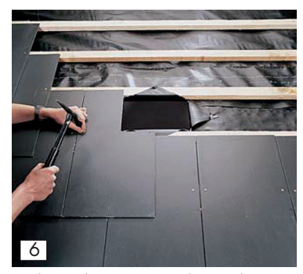
Fix the cut slates in position, leaving the underlay opening exposed.