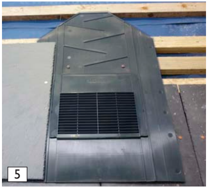
When fixing the adjacent 500mm x 250mm slates, they should abut the main vent body (see guide marks on vent).