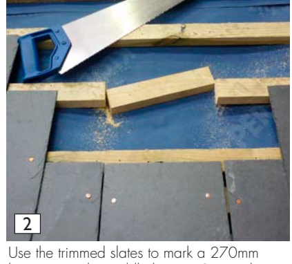
Use the trimmed slates to mark a 270mm long gap in the middle batten. Cut out this section of batten.