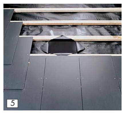
If required, an additional underlay seal is available.