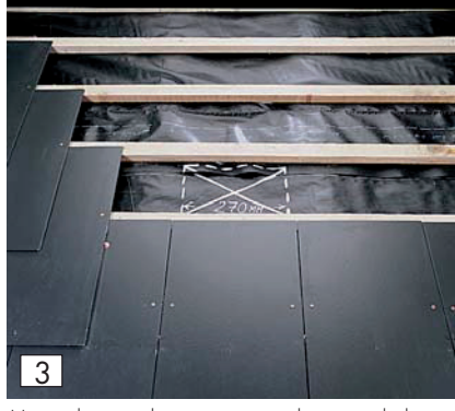
Using the cut slates as a template, mark the underlay diagonally as shown. This is the cutline.