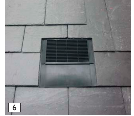
At gauges below 225mm, slight trimming of the slates in the course above the vent, may be required.

For all sales enquires/orders, call or fax our Dedicated Customer Service Hotline and you will automatically be connected to the internal sales representative dealing with your area.