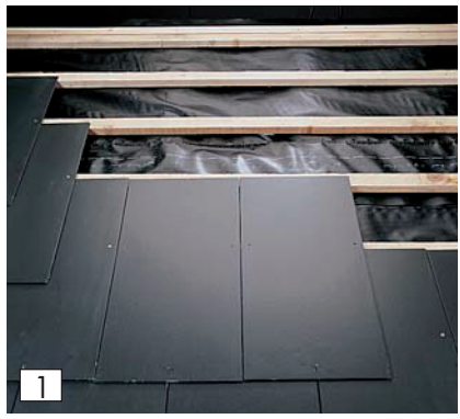
Decide in which course the vent is to be fitted and lay slates up to the course below. Lay the two slates directly below the vent.