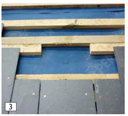
Fix an additional 1.2m support batten above the cut batten (spanning two rafters) and nail to the adjacent rafters.