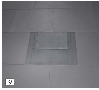
Continue to fix subsequent slate courses as normal. No slate cutting of the course above the vent is required.