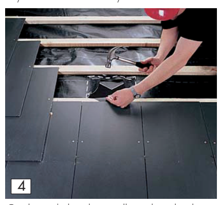
Cut the underlay diagonally and pin back onto the surrounding battens and rafters. For rigid sarking board, cut-out the rectangle.