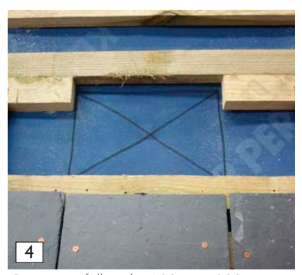
Continue to follow the 600mm x 300mm fixing instructions - steps 3-7 (shown overleaf).