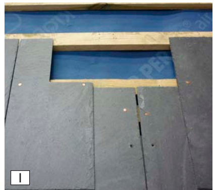
Follow the 600mm x 300mm fixing instructions steps 1-2 (as shown overleaf).